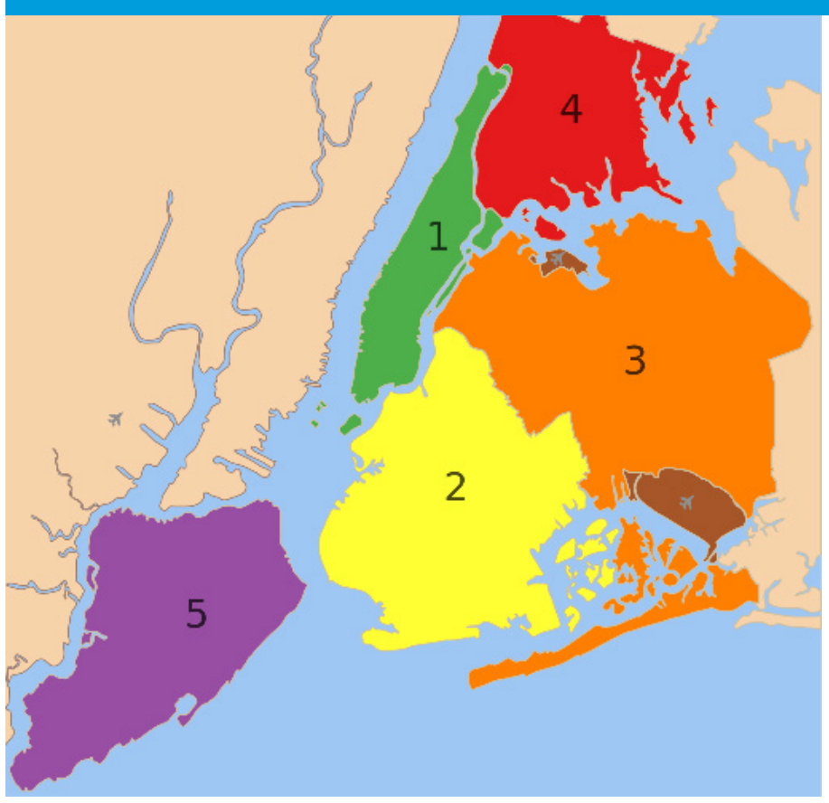
By Vector adopted by User:NafsadhOriginal:Julius Schorzman, Public Domain, https://commons.wikimedia.org/w/index.php?curid=36401671